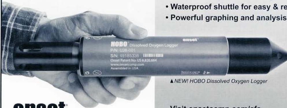
▲ NEW! HOBO Dissolved Oxygen Logger